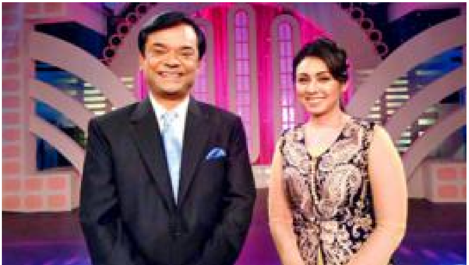
Television of Innovation