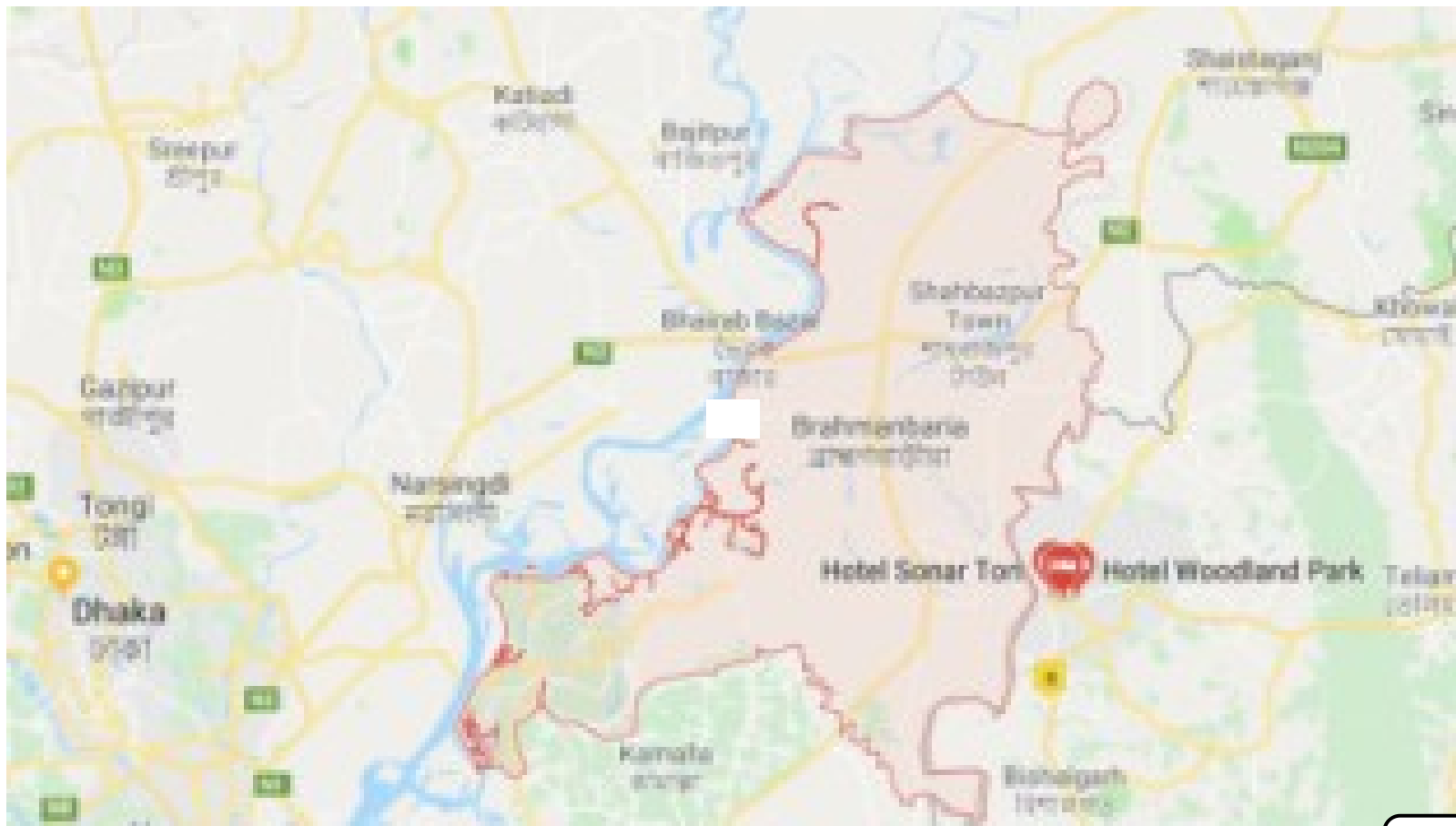
1 killed, over 100 houses damaged during storm in Brahmanbaria